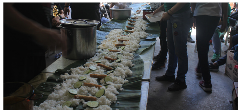
Delicious reward. A healthy boodle fight awaits the volunteers after the first part of the community service.