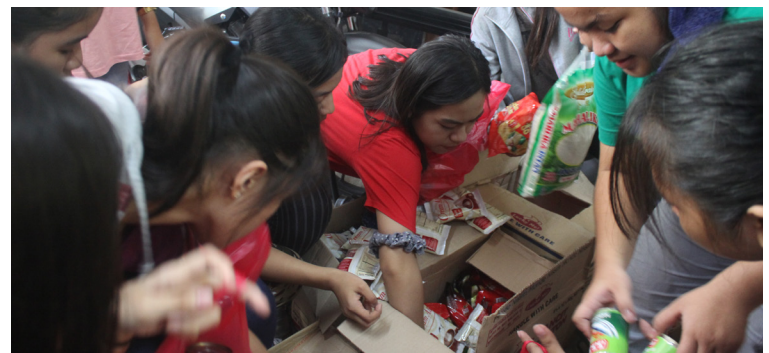
Helping hands. Girls repack the goods to be given to the beneficiaries.