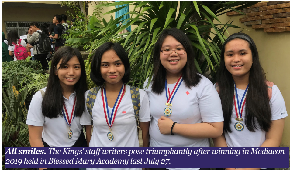
All smiles. The Kings' staff writers pose triumphantly after winning in Mediacon 2019 held in Blessed Mary Academy last July 27.

The Kings' Editorial Board and Staff of Jesus Christ King of Kings and Lord of Lords Academy, Inc. (JCKLA), bagged awards in the Media Convergence 2019 held in Blessed Mary Academy on July 27.