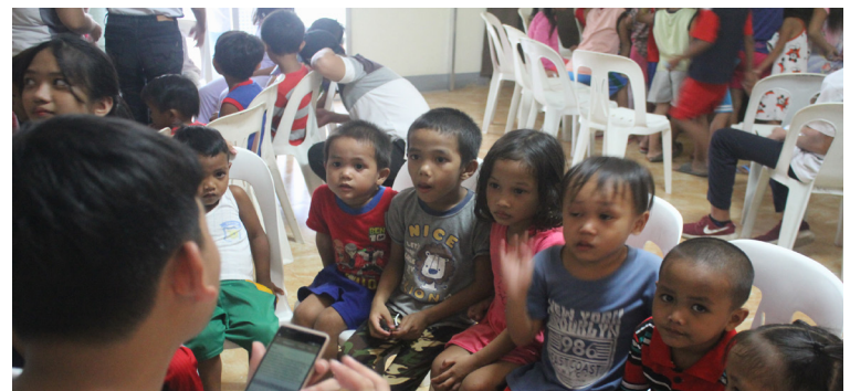
Little teacher. The children attentively listen to their "little teacher" while the latter is sharing a short story.