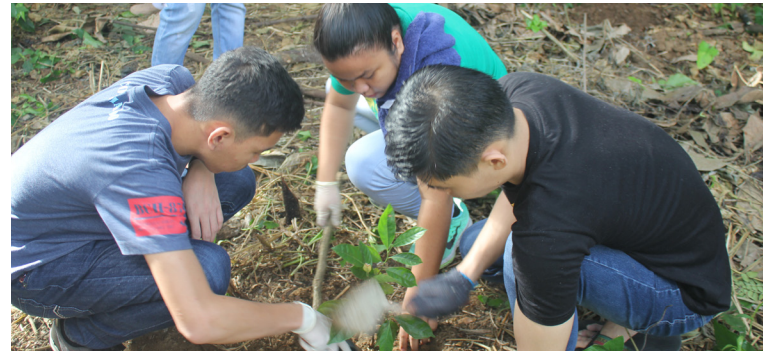
Regreening. STEM students assist each other in planting a cacao tree seedling.

To expose themselves to social work and community development, Grade 11 students rendered a 3-part community service in Silang, Cavite on October 25.